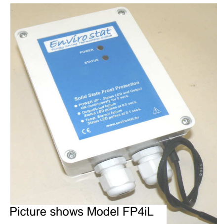
Picture shows Model FP4iL