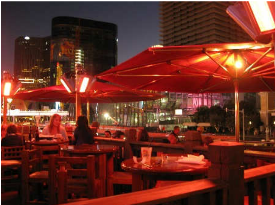
Typical use for Infresco S 6kW

Any application where high in-rush current is an issue or control is required. Typical uses are infrared heating lamps e.g. garden lighting.