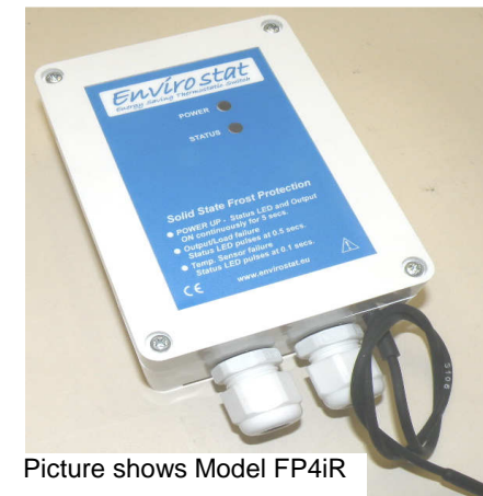
Picture shows Model FP4iR